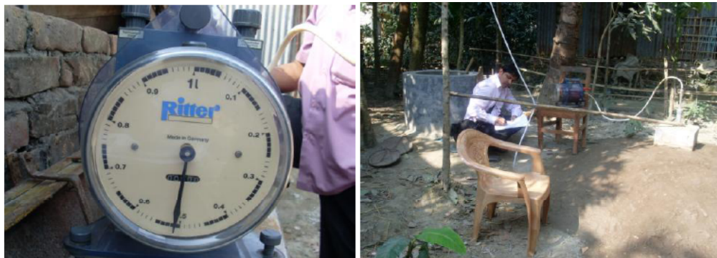
Figure 2: The digital flow meter is used to measure the biogas yield at a test site.

The biogas yield was measured using two methods. An underground biogas plant is able to store gas using the displacement principle, in which slurry is pushed into a reservoir by gas pressure. In the first method, the plant was allowed to produce and store gas for 24 hours. Then the gas was released into a gas balloon through the gas meter. When the gas flow slowed