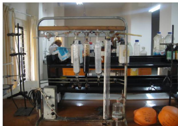
Figure 4: Orsat gas analyser is ready to analyse CH 4 and CO 2 .

the known amounts of CO 2 , H 2 S and CO from the gas sample. The Orsat equipment used to determine biogas compositions are shown in Figure 4. The measurements were used to determine the ratio of methane to carbon dioxide.