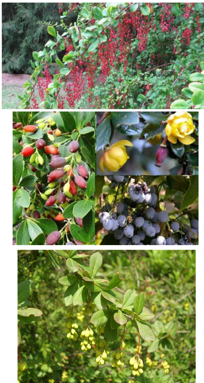
Figure 2: Berberis aristata DC. : Red berries in a flowering branch, yellow flowers, blue berries.

specially used against hepatitis C, B and jaundice. It is also employed as an important ingredient in various antiobesity products [27, 8, 5, 28, 22].