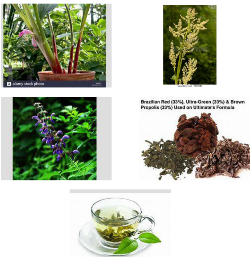
Figure 1: Some medicinal products for dentistry: Kaempferia pandurata , Rheum undulatum , Salvia miltiorrhiza , Propolis, Green tea (up to down, left to right).

**Range of MIC or MBC for other oral microbes tested.