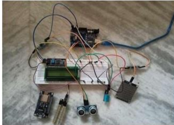
Fig.3: Hardware Implementation with allSensor