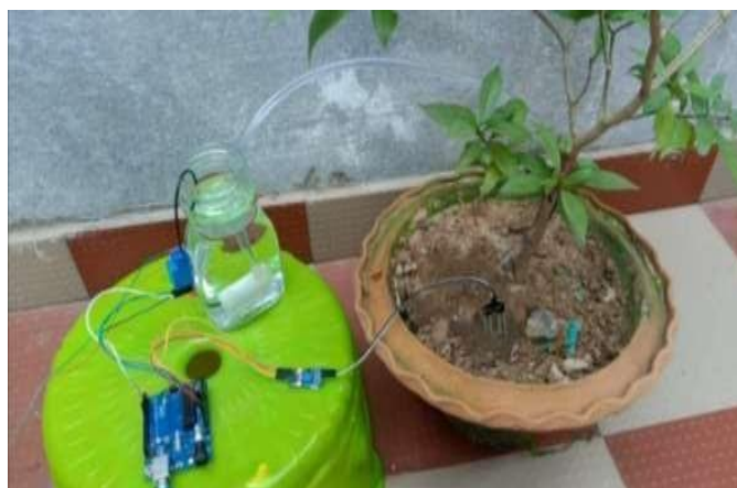
Fig.5: Hardware Implementation with complete assembly