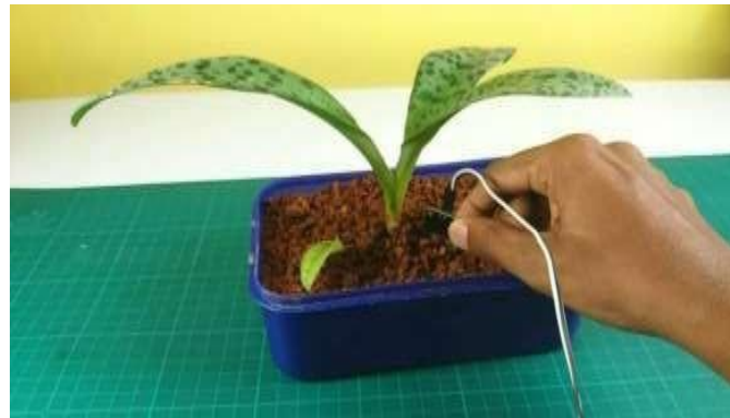
Fig.4: Hardware Implementation with soil sensor in sand