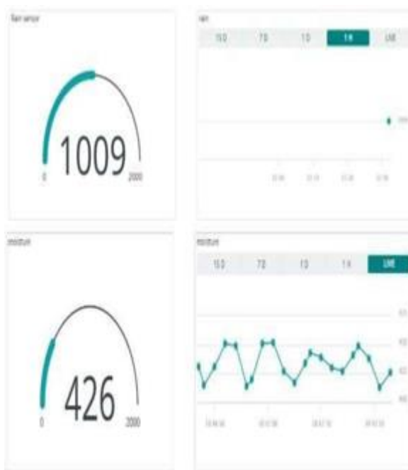
Fig.7: Moisture sensor and rain sensor reading.