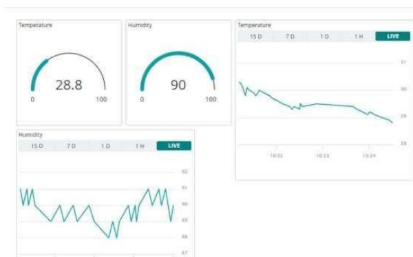
Fig.6: Temperature and Humidity readings.