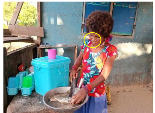
Plate 6. A young lady helping her mother to pre. pare food for meal. She is wearing indigenous jewelries signifying that she is already a lady.