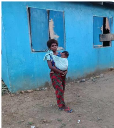
Plate 4. A mother Agta portraying the correct holding position in carrying a baby