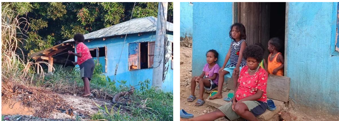
Plate 3. facilitate child birth Left: A pregnant Agta woman n Agta clearing the ground as part of her physical activity to Right: An Agta pregnant woman telling stories and teaching lessons to children

them. The pregnant must sleep in sideward position and should not keep still to evade the aswang from catching the unborn child. No one should pass over a lying or sleeping pregnant nor should anybody sit or stand at the door to keep away from problems to happen during delivery. The pregnant should not stay long in the river so that the child does not become watery and that she should wear barikis (binder) to position the fetus properly in the womb. The pregnant has to consult a meganak during the first trimester of pregnancy and if it happens that she suffers from stomachache, she has to put ilelus leaves on her stomach to relieve the pain. In order for the pregnant not to suffer colds, she has to drink the water of boiled labtang , a vine herbal medicine. Pregnant Agta, these days, are already open to consult registered midwives and medical doctors for pre – natal and post – natal care. The Local Government Unit of Ilagan even goes to the extent of providing medical services and medicines.