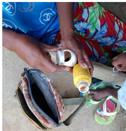
Plate 2. Betel nut and its ingredients usually offered during the traditional wedding of the Agta

The community does the wedding preparation. The men hunt and fish while the women, together with the bride prepare the food. The wedding ceremony is usually done in Sulimanan, a place in the Sierra Madre Mountain where the Agta stay longer than stay in Lupigue within the year. It is officiated by a community elder. Betel nut and its complete ingredients are essential in this ceremony without which the wedding ceremony shall not start. The bride and groom chew the betel nut with the ingredients and after they finish chewing, they are proclaimed as husband and wife. The food prepared is served to everybody in the community. Immediately after eating, the newly wed will build their own simple house which takes one or two hours to construct. These days, Pastors or government officials are welcome to officiate wedding ceremonies in Lupigue.