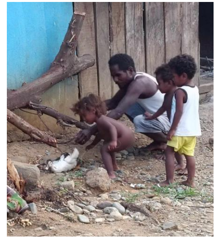
Plate 5. An Agta man teaching Agta children to catch duck as part of their training