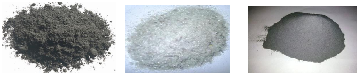
Figure 1. Used Materials in present analysis