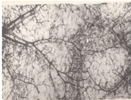
Fig.2. Blood vessels of the submucosa of the small intestine wall on the 4th day of experimental peritonitis correction. 1 - main artery; 2 - main vein; 3 - arteriole; 4 - capillary network. Pouring vessels with the mass of Gerota. 8×7.

There were no visible changes in the muscular layer. In the outer muscular membrane of the intestine, edema and divergence of myocyte bundles decreased. Mesothelial cells of the serous membrane are in the form of flattened cells with a hyperchromic nucleus. Foci of newly formed mesothelial cells appear. Edema of mesotheliocytes and connective tissue structures is noted. The subserous connective tissue is loosened, slightly infiltrated with mononuclear cells, the MCR vessels are without any special changes. The positive effect of detoxification with enterosorbent was also reflected in the morphological state of the microvessels of the small intestine wall. There was a decrease in spasm of arterial vessels, while maintaining a moderate plethora of venous and edema of the vessel walls. As a result, blood flow was restored in most microcirculation vessels. Intraorganic microvessels of the small intestine wall tended to gradual leveling of inflammatory-reactive processes (Fig. 2). Signs of vasculitis were found in some small vessels.