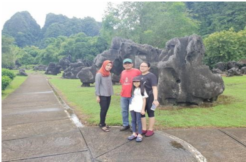
Image 14. General tourists visiting the Leangleang Prehistoric Park

Therefore, Leang Petta Kerre and Leang Pattae which have been arranged in such a way as Leangleang Prehistoric Park have the most potential for this type of public tourism. Accessibility to reach the location is quite adequate, can be reached by various types of vehicles, and provides various cultural and natural attractions. The natural environment with some of its uniqueness is quite interesting for visitors, including karst rock gardens, rivers, cliffs and karst hills, caves with stalagmite and stalactite ornaments, animals, butterflies, Sulawesi black monkeys, and beautiful and cool natural scenery. From a very iconic cultural aspect, there are cave wall paintings at Leang Petta Kerre and Leang Pettae in the form of hand stencils, pig deer, and other motifs that date back 45 thousand years. Other cultural attractions are prehistoric human settlements in the form of prehistoric caves and various cultural remains, there is a mini museum filled with photographs and artifacts, and the life of the surrounding community.