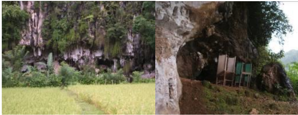
Image 11. Location of Leang Timpuseng, agricultural equipment, and large rice fields

Leang Timpuseng is at the astronomical point 04^{\circ} 59' 53.5'' EL and 119^{\circ} 39' 39.8'' SL, the height of the cave is 25 m, facing east. Under the floor of the cave, there is a cavity that is stagnant with water with a large discharge so that it can be used to irrigate the rice fields around the cave. This cave includes sheet stocky caves [13]. On the stalactites and cave walls, water still drips from the rock pores, while the ceiling of the cave is inhabited by bats and swallows.