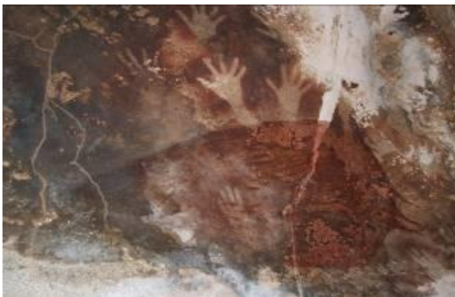
Image 3. Cave wall paintings of hand stamps