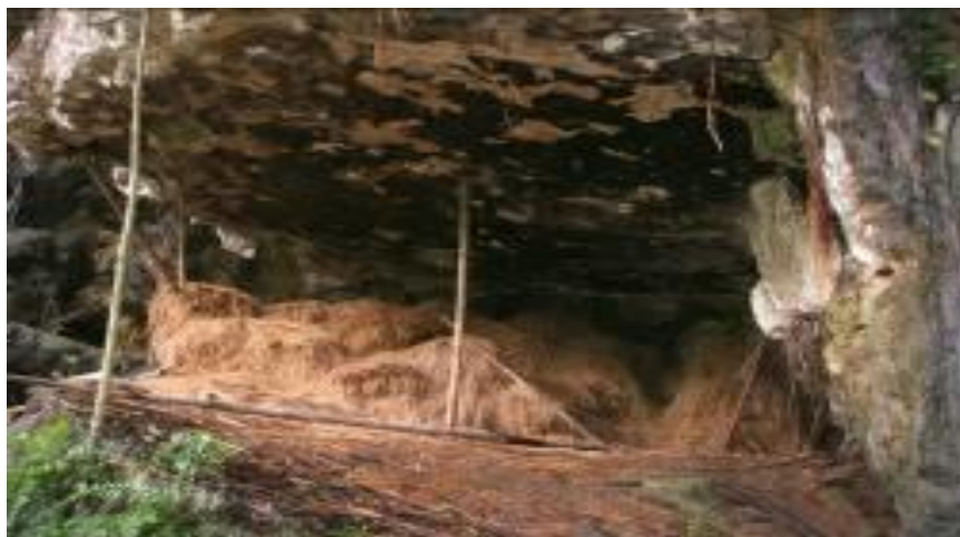
Image 10. The condition of Leang Pangia as a place for storing agricultural products

The location of Leang Burung is at the astronomical points 05O 00' 11.9" South Latitude and 119O 39' 17.9" East Longitude with a height of 45 m above sea level and about 4 meters from the ground. The air temperature inside the cave cavity averages around 29°C with a humidity of 85%, while the humidity of the cave walls ranges from 23-28%. Leang Bird has two mouths with a distance of about 30 meters. This cave has a direction facing west with a ceiling height of between 10-25 meters. This cave is a sheetrock cave [13], at the front of the cave there is a wide expanse of rice fields.