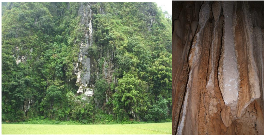
Image 9. Leang Alla Puse with beautiful cave ornaments with beautiful natural scenery

Leang Alla Pusae is at the astronomical point 04^{\circ} 59' 12.1'' East Longitude and 119^{\circ} 40' 16.1'' South Latitude, facing the cave to the north. The height from the ground is 8 meters and the slope is 400. The inside of the cave consists of two rooms, the west room is 5 meters long, while the eastern room is about 80 meters long. This cave includes a combination of sheet joints and pillar joints. On the stalactites and cave walls there is water dripping from the rock pores, while the ceiling of the cave is inhabited by bats and swallows. On the walls of the cave, there are very beautiful stone color ornaments.