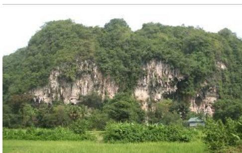
Image 10. Leang Burung where a large rice field is located at the foot of the karst tower

The location of Leang Burung is at the astronomical points 05^{\circ} 00' 11.9'' SL and 119^{\circ} 39' 17.9'' EL with a height of 45 m above sea level and about 4 meters from the ground. The air temperature inside the cave cavity averages around 29^{\circ}\text{C} with a humidity of 85%, while the humidity of the cave walls ranges from 23-28%. Leang Bird has two mouths with a distance of about 30 meters. This cave has a direction facing west with a ceiling height of between 10-25 meters. This cave is a sheetrock cave [13], at the front of the cave there is a wide expanse of rice fields.