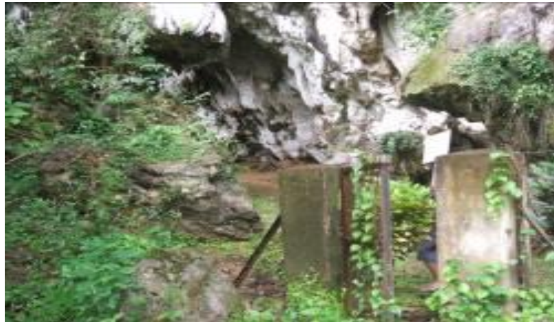
Image 8. The Front Leang Bettue with security gate.

The cultural remains that can be witnessed are several cave wall paintings in the form of hand stamps, stone tools, leftover shells, and pottery fragments. Archaeological research through excavations found the upper jaw found a skeleton of the upper jaw that was around 39,000 years ago [7]. This cave is used by local residents to store some agricultural equipment, in front of the cave used as a cowshed. The mouth of the cave has been fenced with broken barbed wire. This cave can be reached on foot via a path from the highway about 100 m, not yet equipped with supporting facilities. In front of the cave, there is a natural view of gardens, rice fields, rows of karst rock hills, and residential areas.