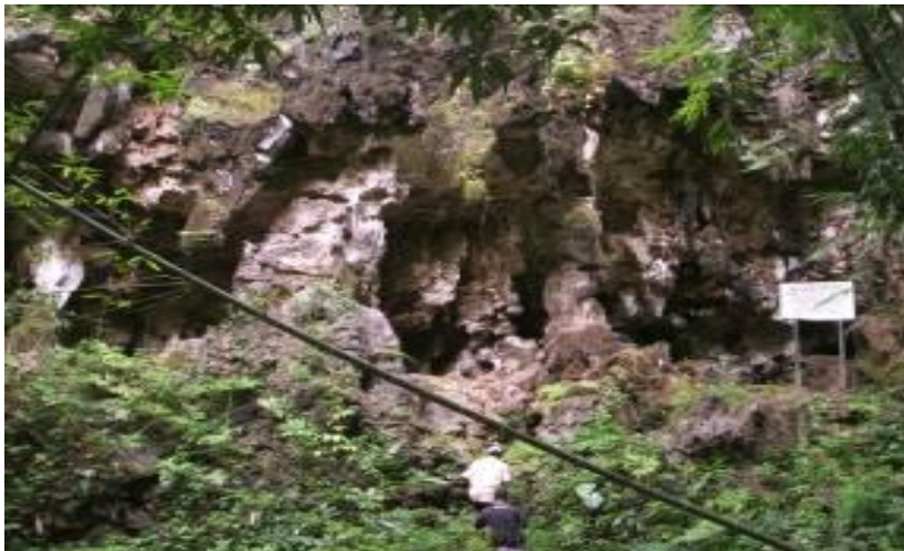
Image 12. The mouth of the Leang Bulu Tengngae

Remains of prehistoric culture that can be observed at Leang Bulu Tangngae are 14 cave wall paintings in the form of hand stamps, two paintings of pigs and deer, mollusk shells, various types of stone tool remains, pottery fragments, and animal bone remains. At the front of the cave, razor wire has been fenced as a safety net. It can be reached from the main road for about 120 m by footpath, not yet equipped with supporting facilities. Around the cave, there is natural scenery in the form of rows of karst hills, gardens, and residential areas.