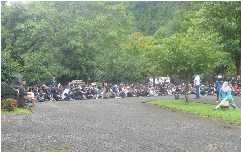
Image 15. Visitors to educational tourism at the Leangleang Prehistoric Park

Tourism for Education is recreation or tourism trips undertaken with the aim of restoring fitness or freshness in which added value is instilled in education. This tour generally targets students or school children, from early childhood to high school, even to the tertiary or university level. For this reason, the tourist objects prepared are tourism objects that provide many attractions related to formal and non-formal learning objects.