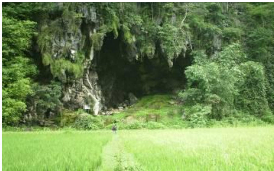
Image 5. Leang Tinggi Ada with a rice field area around

Archaeological findings in Leang that can be witnessed are 1 hand stamp with a red background in damaged condition. Cultural finds include remains of mollusk shells, pottery, and stone artifacts. Inside the cave, there are water droplets from several stalactites and cave walls, and on the ceiling of the cave, there are bats and swallows. The cave site has been managed by carrying out fencing, but road access is only in the form of a footpath through the rice fields from the ground and there are no other supporting facilities available. The scenery in the cave is very beautiful, namely on the west side of the cave there is a stretch of rice fields, rock mountains, and local residents' villages. The site has the potential to be developed as a tourist attraction, because it is located not far from the main road, close to residential areas, and has beautiful and charming natural scenery.