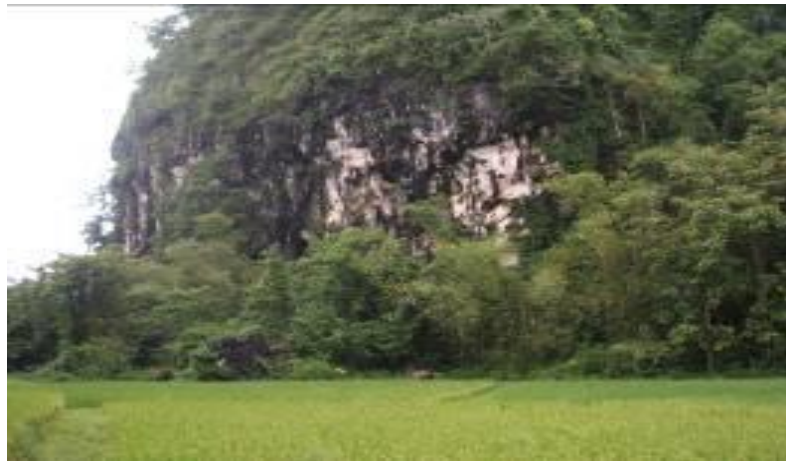
Image 6. The location of Leang Pajae Cave is at the foot of a karst tower with beautiful views.