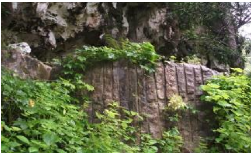
Image 7. Leang Ulu Wae which formerly has traces of mining activity on the front

The cultural findings that can be witnessed at Leang Ulu Wae are 4 hand stamps that have been damaged. This cave is used by the local community to store agricultural products because it is close to residential areas. The atmosphere inside the cave is flat and can be used for shelter. At the front of the cave, there is a natural view of rows of karst rock hills, rice fields, and residential areas. This cave is located about 90 m from the main road and can be reached by footpath, not yet equipped with supporting facilities.