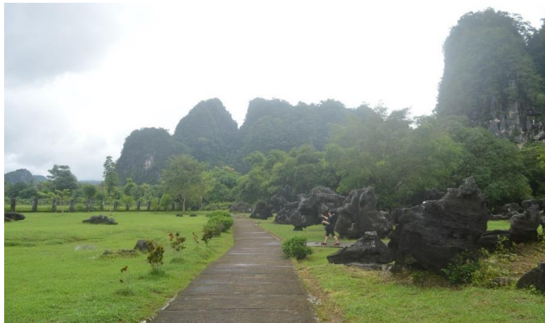
Image 1. Leangleang Archaeological Park in Maros Regency