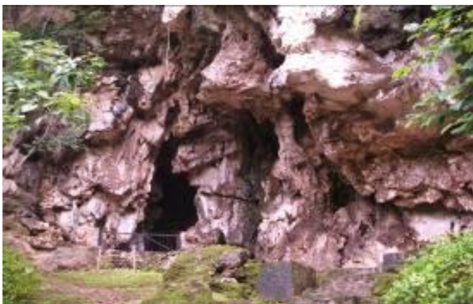
Image 4. The gate of the cave at Leang Pattae

The location of Leang Petta Kerre is in the Leangleang Archaeological Park complex with astronomical points 04O 58' 43.2" SL and 119O 40' 34.2" EL with a height of 45 m above sea level. The air temperature in the upper cave ranges from 27°C with an average humidity of 65%, while the average humidity of the cave walls ranges from 17-22% [13]. Leang Petta Kerre consists of two rooms, namely the upper and lower rooms. The lower room is 2 meters above ground level, while the upper room is about 13 meters above ground level. The lower room is a niche with a width of about 15 meters while the upper room is a cave with a mouth of 4 meters. Archaeological remains at Leang Petta Kerre are wall paintings in the form of 16 handprints with red backgrounds and 2 paintings of red pig deer in the upper room. Other cultural evidence is in the form of prehistoric human tools from stone (flake tools), pottery fragments, food leftovers from mollusks, and findings of prehistoric human skulls. This site has been well managed, namely the availability of facilities for tourists, such as concrete staircase paths, seats, gazebos, toilets, prayer rooms, neat, clean garden arrangements, and very beautiful views.