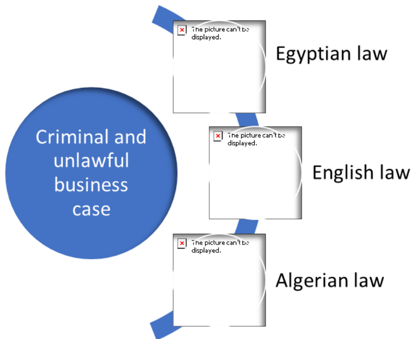
Figure 2: Laws that have given the individuals the rights to agree to exemption conditions.