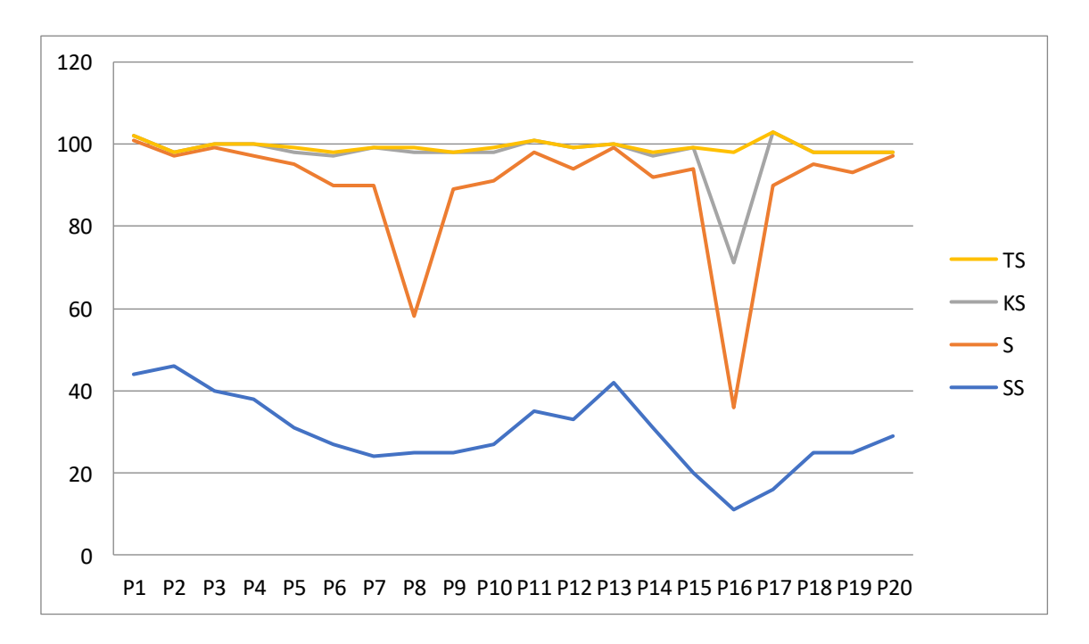
Graph of Canva Utilization as Learning Media

agency can use it, even this application is published for everyone around the world so that they can create any design and anywhere.