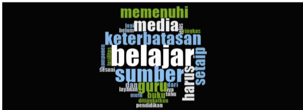
Figure 3. APKG 2 World Cloud by NVivo

The following step in case study research is data collection, which includes gathering information from informants through in-depth interviews in order to dive deeper into topics about program implementation, teacher performance, and educational service quality. Data is gathered by recording and field notes ( see figure 3).