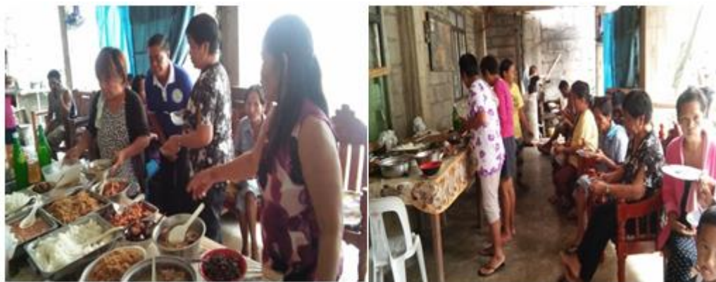
Plate 16. The Gaddangs Practice of Mappakkan Si Bisita during Fiesta.

The Gaddangs have their traditional and customary ways during weddings . The celebration starts with patontol ( a ritual to drive away evil spirits where there is spontaneous hitting of the attung (mortar)and allu (pestle) while the male family members of the groom dance around the hollow and the female members of bride's family clap. The customary practices in marriage are then observed in the church ceremony. After the ceremony in the church, the newly weds proceed to the bride's residence where relative await at the entrance to perform the pakuwad ( shower of coins and rice grains ) so that the couple will be blessed with abundance and happy life, then the couple enter the house walking side by side for the next customary belief- a prayer called ammeda maabban ( not to lose minds) led by elders. After the prayer, the couples kiss the hands of the parents to give respect and then proceed to the pabbodan (dance hall) for the pagala ( the couple dance while the visitors and relatives pin money to their clothes). Balyawan, the last wedding ritual, is performed with the elders and eight pairs of boys and girls from family where both parents are alive. The elders sing advice to the newlyweds while the boys and girls dance, with them kicking each others feet. This is done to ensure long life and prosperity for the newlyweds.