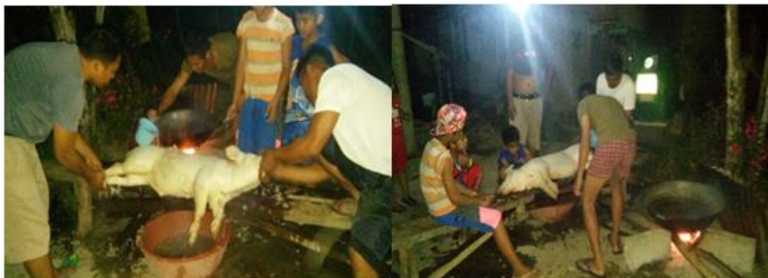
Plate 15. The Gaddangs Practice of Mapparti si Bafuy (Butchering Sidro or Pig) during Fiesta.

Fiesta is another much observed custom and tradition by the Gaddangs. This is to give thanksgiving to God for the manifold blessings. This is also a time for coming home for those living and working in other places. This is also the time to entertain political leaders and influential people. This customary belief and practice is patterned from the Spaniards. A result of acculturation and diffusion where the old tradition is not forgotten but the new structure not totally established.