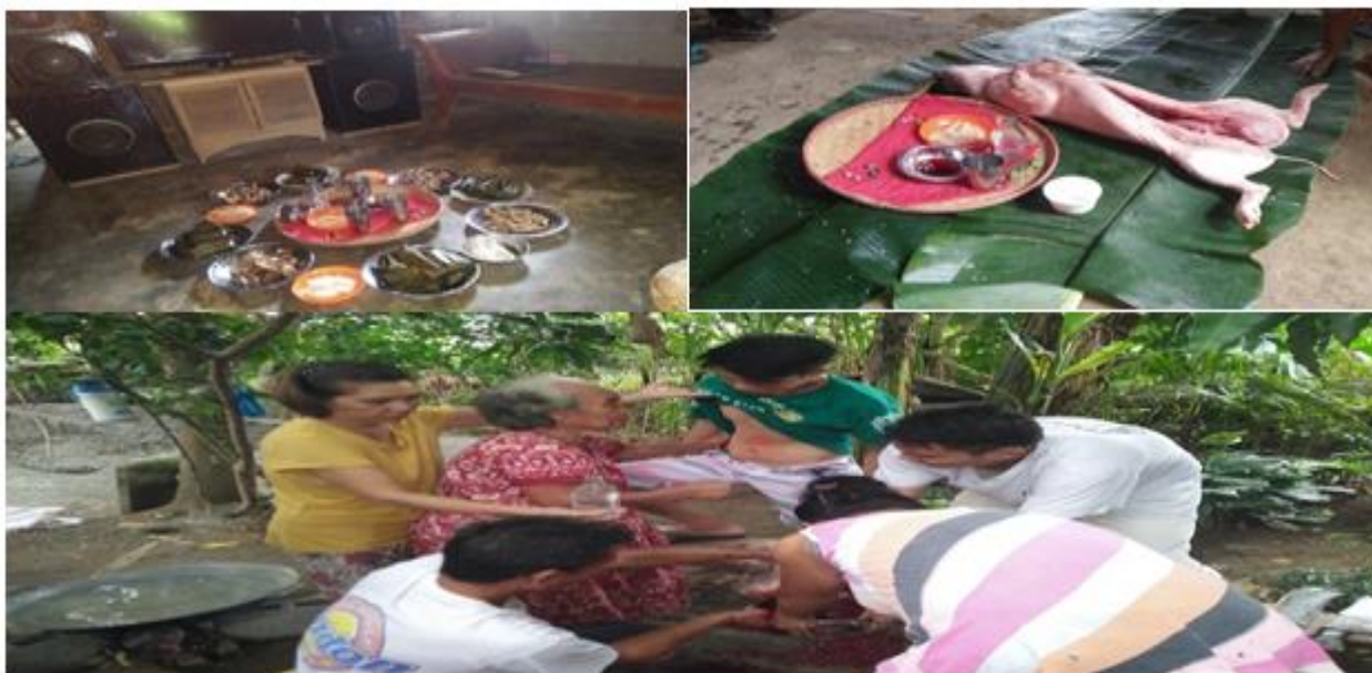
Plate 21. The Gaddangs Practice of “Lattang” Ritual in Healing Sicknes.

Gaddangs believe that long term sickness is caused by supernatural beings such as the unseen spirit or the caralua (soul of their dead ancestor or relatives or former owner of the lot where their house is built). Healing of the sick is done through an albularyu (medium ) who talk to the caralua (spirit). The warit is done to show respect to the souls of their dead loved ones and other caralua . Mangacao is a ritual to bring back the soul or spirit of the child allegedly possessed by unseen spirits. Another is pamanyok where the godparents of the sick child participate in the ritual. In these instances of healing the sick caused by unseen forces, the albularyu performs the warit (food offering) to appease the spirits and that the sick will be healed. These customary beliefs and practices are somewhat forgotten by some Gaddangs when they come in contact with the new structure brought by education through the classroom and interaction with other culture. Another is the result of intermarriage with other culture. Nowadays, Gaddangs go to physicians when there is sick in the family. But when a situation calls for adherence to the tradition, the Gaddangs go back to their roots of faith.