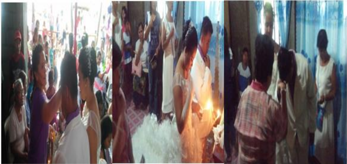
Plate 19. The Gaddangs Couple Kneel and Pray together led by a Prayer Leader.