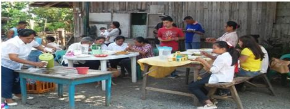
Plate 4. After Baptism Ceremony, This Follows Celebration Usually Consist of Luncheon in the House were People Gathered Together.