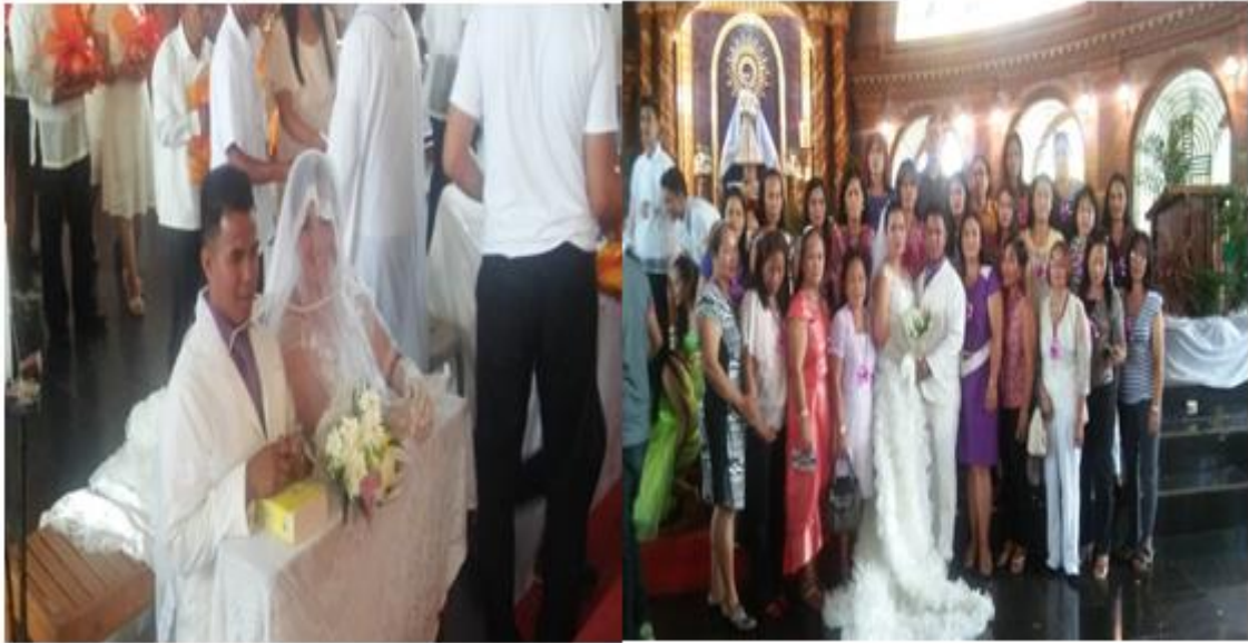
Plate 18. The Gaddangs Customs during the Church Wedding.