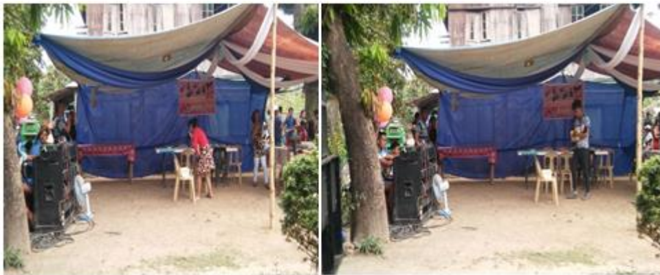
Plate 6. The Gaddangs Practice Of Pagala during Baptism.

The child is a source of happiness among the Gaddangs, a priceless possession. They celebrate their birthdays as a form of thanksgiving because the child and their family received so much blessings and these should be shared to other people in the community. It is also believed that if the child's birthday is not celebrated, sickness may fall on her/him. During the celebration, delicacies such as pinalattat ( rice cake), pinatarak (a combination of small rounded rice dough, banana, yam cooked in coconut milk) are prepared. Nobody is allowed to eat without the customary belief warit (food offering for the unseen spirits) performed. After the warit is done, all visitors eat, sing and dance. The presence of friends and relatives during birthday celebrations are highly valued by the Gaddangs. The occasion strengthens kinship.