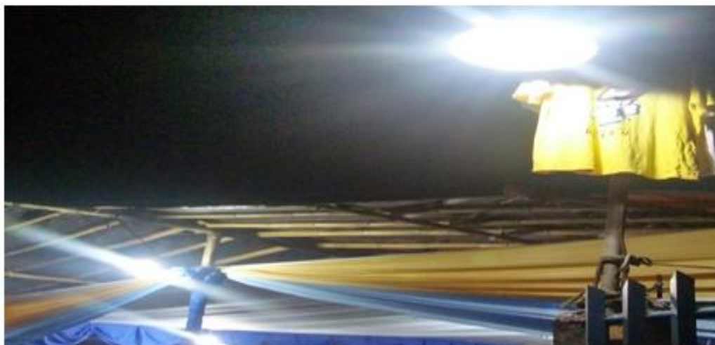
Plate 17. The Gaddangs Practiced of Hanging the Dresses of the Couple.

The Gaddangs have their traditional and customary ways during weddings . The celebration starts with patontol ( a ritual to drive away evil spirits where there is spontaneous hitting of the attung (mortar)and allu (pestle) while the male family members of the groom dance around the hollow and the female members of bride's family clap. The customary practices in marriage are then observed in the church ceremony. After the ceremony in the church, the newly weds proceed to the bride's residence where relative await at the entrance to perform the pakuwad ( shower of coins and rice grains ) so that the couple will be blessed with abundance and happy life, then the couple enter the house walking side by side for the next customary belief- a prayer called ammeda maabban ( not to lose minds) led by elders. After the prayer, the couples kiss the hands of the parents to give respect and then proceed to the pabbodan (dance hall) for the pagala ( the couple dance while the visitors and relatives pin money to their clothes). Balyawan, the last wedding ritual, is performed with the elders and eight pairs of boys and girls from family where both parents are alive. The elders sing advice to the newlyweds while the boys and girls dance, with them kicking each others feet. This is done to ensure long life and prosperity for the newlyweds.