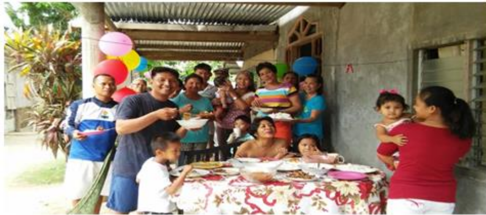
Plate 9. The Gaddangs Celebrate Birthdays together.