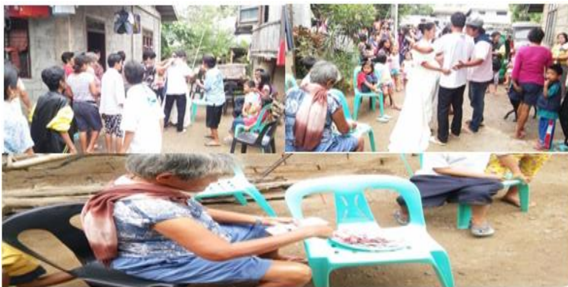
Plate 20. The Gaddangs Practice Pagala during the Dance of the new Couple.