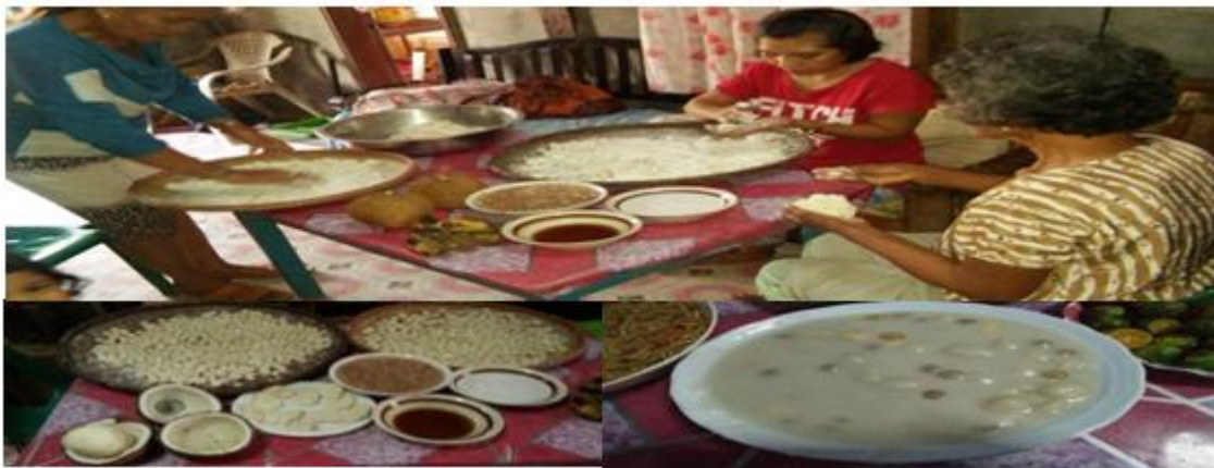
Plate 10. The Gaddangs Practice to Serve Pinatarak and Pinalattat (Rice Cakes) during Birthdays.

Fiesta is another much observed custom and tradition by the Gaddangs. This is to give thanksgiving to God for the manifold blessings. This is also a time for coming home for those living and working in other places. This is also the time to entertain political leaders and influential people. This customary belief and practice is patterned from the Spaniards. A result of acculturation and diffusion where the old tradition is not forgotten but the new structure not totally established.