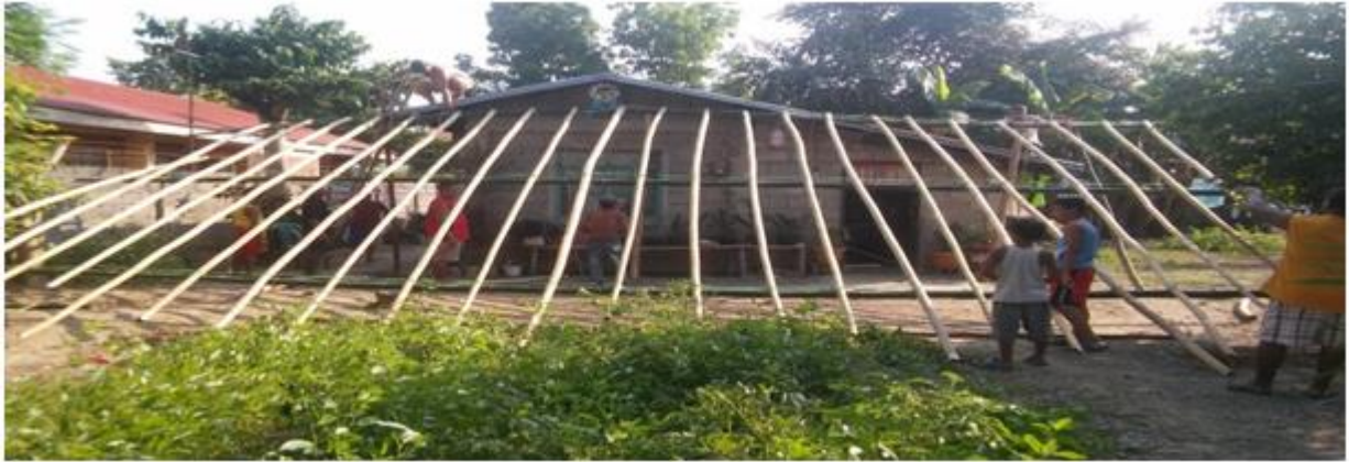
Plate 22. The Gaddangs Practice of Making Damara with the help of the Neighbors.

The customary beliefs and practices of the Gaddangs during death and burials are combination of the old and new. While they assimilated themselves with the modern practice of embalming the dead, they still believe in wearing white twine on the forehead, a sign of mourning and to prevent headaches from lack of sleep during the wake. Wearing of red colored dress is prohibited to show respect to the dead and to the bereaved family. They still believe that when a butterfly gets near the coffin, the spirit of the dead or other relatives are present. The family and relatives offer prayer for the soul of the dead as practice today. The dead is brought to the church for a mass before interment and do the customary rituals accordingly like washing of hands and wetting the forehead with the hot water from boiled guava leaves to prevent headache and body pains of family members, relatives and all those who attended the funeral.