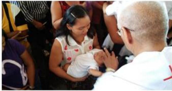
Plate 3. A Gaddang Child Baptized in the Church by a Priest.