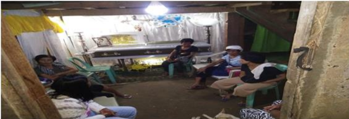
Plate 23. The Gaddang Members Stay Near the Coffin during Wake of a Dead Person.

The customary beliefs and practices of the Gaddangs during death and burials are combination of the old and new. While they assimilated themselves with the modern practice of embalming the dead, they still believe in wearing white twine on the forehead, a sign of mourning and to prevent headaches from lack of sleep during the wake. Wearing of red colored dress is prohibited to show respect to the dead and to the bereaved family. They still believe that when a butterfly gets near the coffin, the spirit of the dead or other relatives are present. The family and relatives offer prayer for the soul of the dead as practice today. The dead is brought to the church for a mass before interment and do the customary rituals accordingly like washing of hands and wetting the forehead with the hot water from boiled guava leaves to prevent headache and body pains of family members, relatives and all those who attended the funeral.