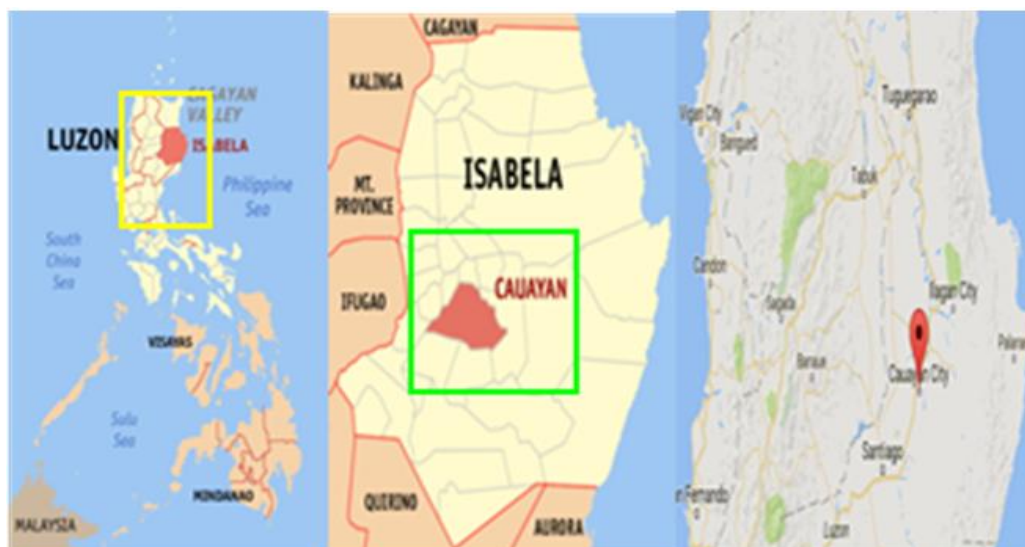
Plate 2. (Left) Political Map of the Philippines. (Center) Political map of Isabela and (Right) political map of Cauayan City, Isabela.

Participant Observation is a research technique in ethnographic study, wherein, the researcher directly observe the family and village life by staying in the community being studied for a period of time.