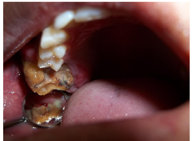
Figure 1: Intraoral view of the mass.

patient's history, she has noticed the lesion during the third trimester of her pregnancy and attended to a dental practitioner. However, her dentist has denied to take an orthopantomography (OPTG) and removal of the mass due to the the pregnancy and delayed the ablative surgery to the end of the pregnancy. After consultation with her obstetricians during the 4 th week of the postpartum period, an OPTG was taken and radiopaque mass and ill-defined impacted molar teeth were observed (Figure 2). The patient was referred to our hospital due to the necessity of an operation general anesthesia. After a provisional diagnosis had been made, complete removal of the lesion was performed and the adjacent impacted molar tooth was extracted under general anaesthesia. The patient was operated under general anesthesia via oroendotracheal