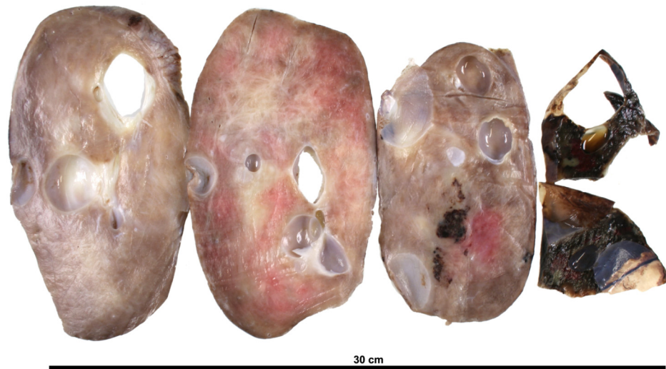
Figure 1: Solid mass with a homogeneous rubbery meaty brown cut surface and focal haemorrhagic area at one end. Smooth thin-walled cystic locules are seen, the largest 40 mm in maximal diameter.