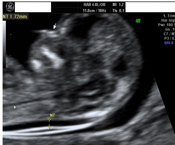
Figure 1: Measurement of NT. Nasal bone depicted by an arrow.

from 2.1mm to 2.7mm from a CRL of 45mm to 84mm [16]. A positive NT scan is defined as a NT measurement which is more than the 95 th centile for a given CRL. The larger the NT measurement, the higher the likelihood ratio and therefore greater the new risk, in contrast the smaller the NT, lower the new risk for chromosomal abnormality. The thickness of the NT is important in estimating the risk and not its appearance e.g. whether it is septated or not, restricted to the fetal neck or enveloping the entire fetus [17]. Increased NT usually resolves after 14 weeks, however in some cases it can further evolve to nuchal oedema, cystic hygroma or fetal hydrops. The median NT for normal foetuses is 2mm, and significantly higher for aneuploidies 3.5mm for T21, 5.5mm for T18, 4mm for T13 and 9.2mm for 45XO.